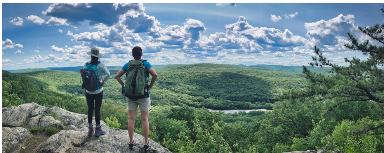
View from West Mountain