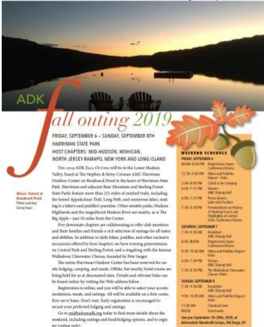
Above: Sunset at Breakneck Pond