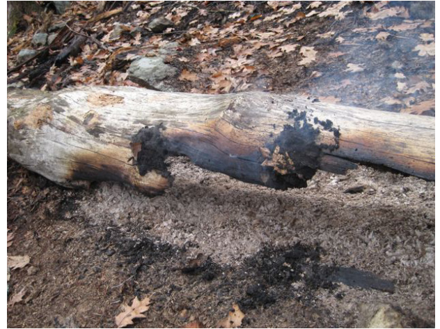
Still on fire