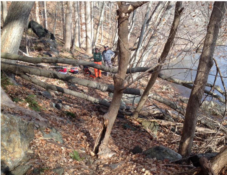
3 Bar Gate Before