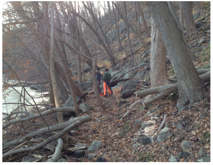
3 Bar Gate After