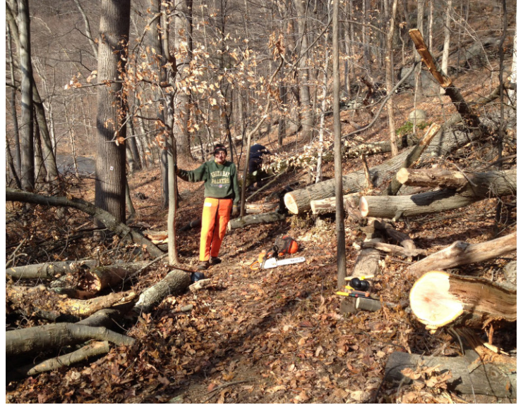
Giant Mess After