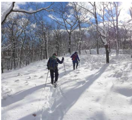
The Trail Marker

For any who desire an alcoholic beverage, drink orders will be taken/served at each table "cocktail style." Please be sure to bring an appropriate amount of cash to cover the cost of whatever drink you might order.)