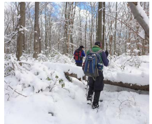
January-March 2015