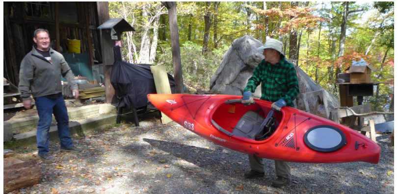
The Trail Marker