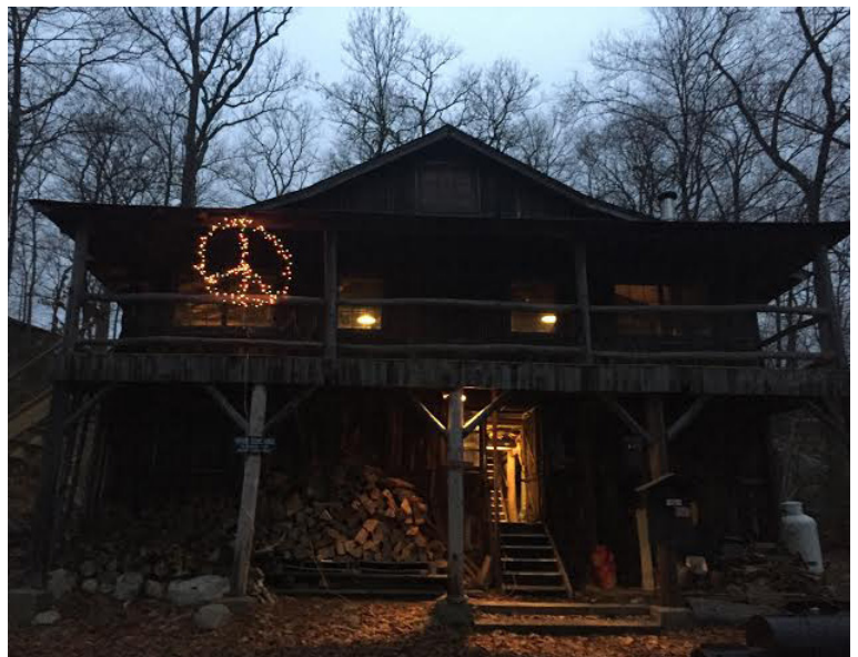
Boxing Day, December 26, at Camp Nawakwa