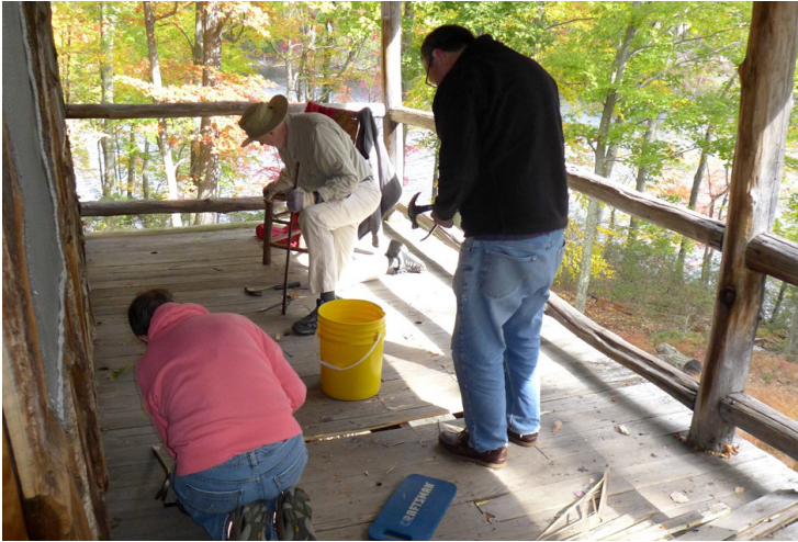
Fall Wood/ Work Day