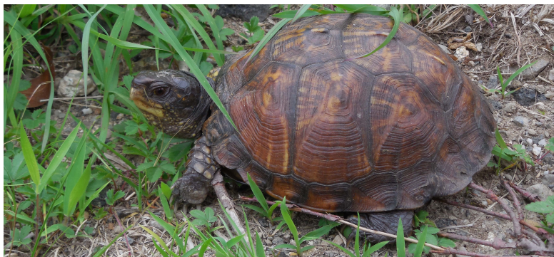
Nawakwa box turtle