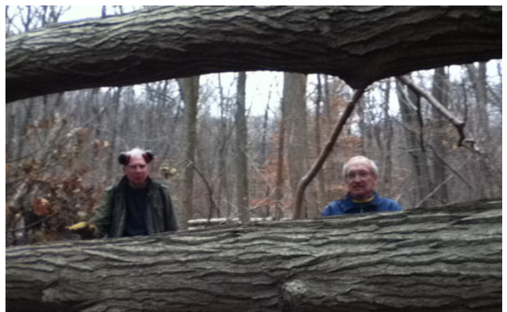
Two, two, two trees in one!