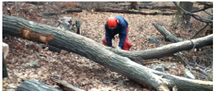
Steve in action