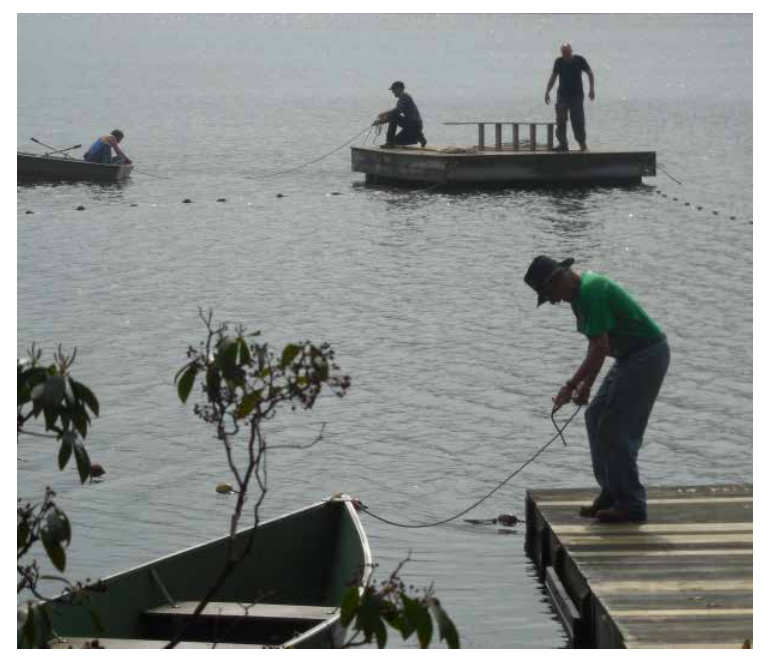
Setting up the swim platform, May 10, 2014.