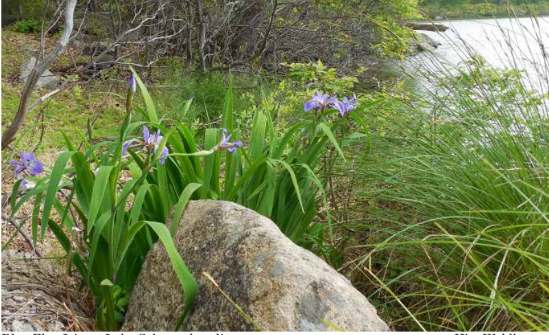
Blue Flag Iris on Lake Sebago shoreline.

In the near future I plan to repair the sagging shelves in the blanket closet in the infirmary. As always, please bring any building maintenance issues to my attention at kimw@adkny.org