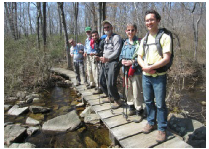
Palm Sunday Hike