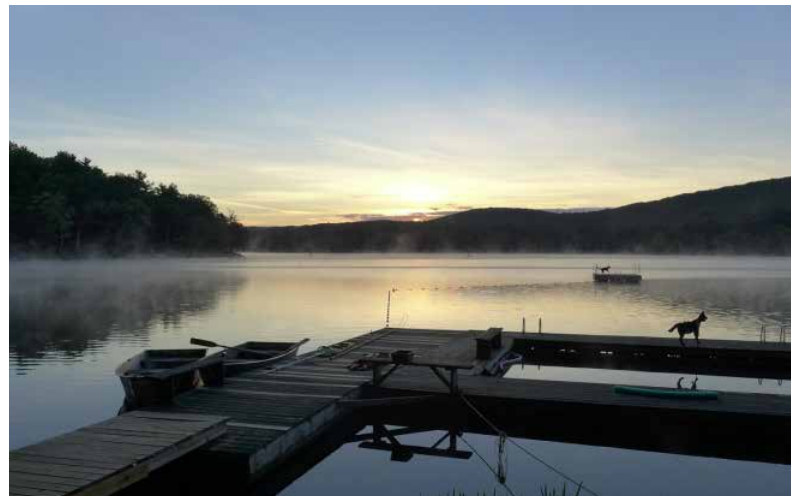
Ever-changing Lake Sebago