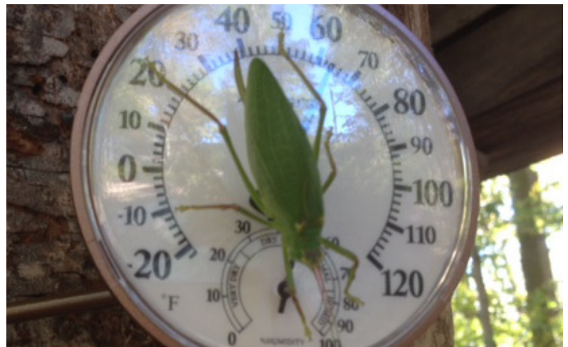
Katydid likes the new thermometer