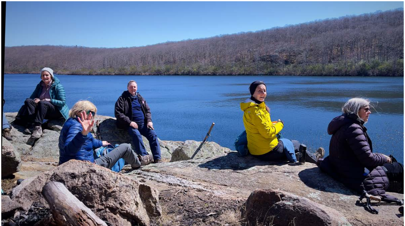
At Breakneck Pond