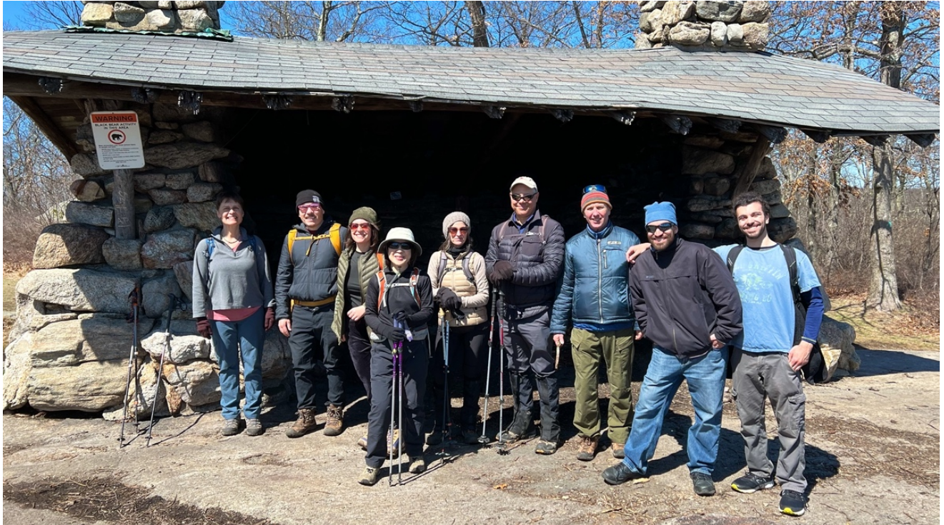
At Big Hill Shelter