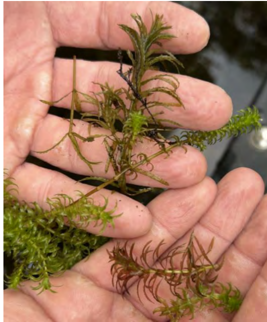
Top: Lake Sebago Hydrilla fragments showing plant variation. Bottom: Underground tubers (left) and above ground turions (right).